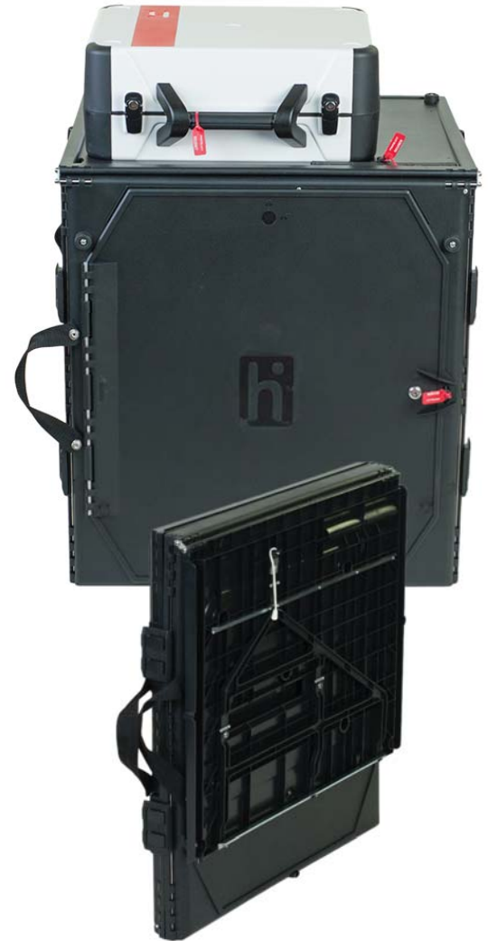
Ballot box folds to 6" thin

Only Verity uses AIGA Design for Democracy templates; its plain language interface is the easiest to use.